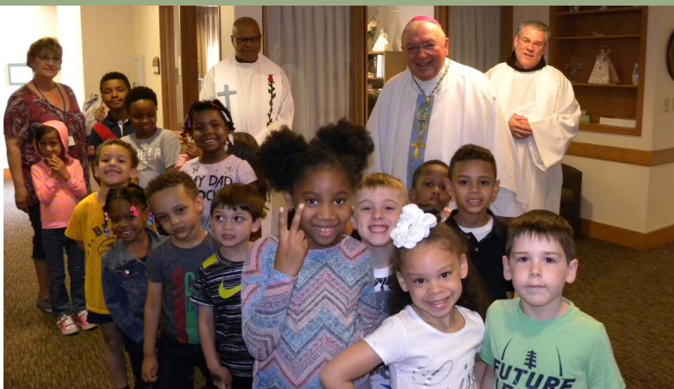
Marymount Child Care Center students prepare to lead the processional for the Mission Day Mass.

A piece of the story of “us” is the life-enriching and also touching effect of regular visits from the Marymount Child Care students. Given that teachers can walk students through the breezeway that connects The Village at Marymount and the Sisters’ Convent, students are able to visit regularly without having to be transported – regardless of the weather conditions outside