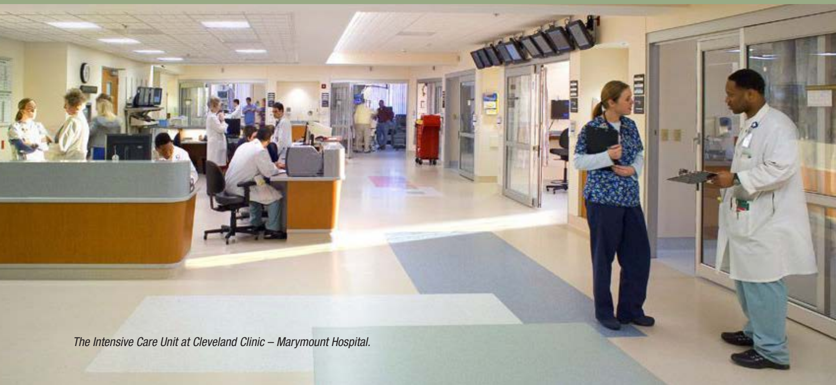
The Intensive Care Unit at Cleveland Clinic – Marymount Hospital.

The presence of medical offices and the hospital on the same campus as The Village at Marymount provides the convenience of closeness that few senior care facilities have. The “us” of this story is that Cleveland Clinic – Marymount Hospital also is an “us” because of the care and services provided to our residents.