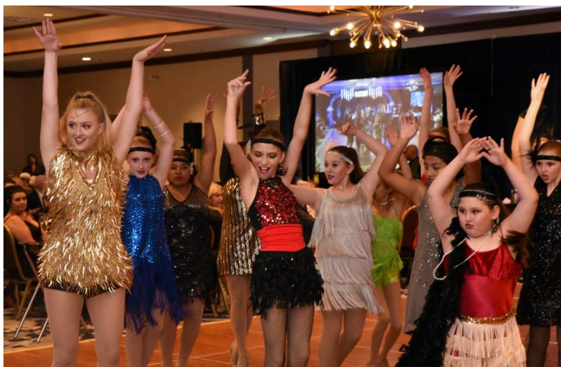
Student dancers from The Studio in Independence performed several Gatsby-era numbers to the delight of Celebration of Life Gala audience.

The Village at Marymount will host its 10th Celebration of Life Gala from 6 to 11 p.m. on Friday, September 20, 2019 in the Holiday Inn Ballroom Cleveland South, 6001 Rockside Road in Independence.