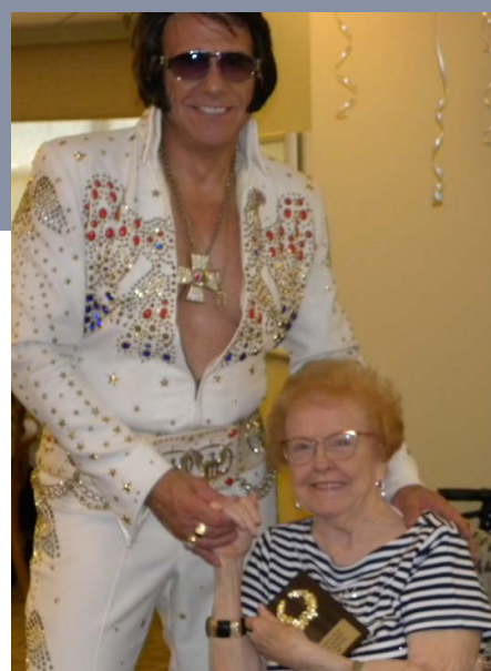
Marymount Place residents enjoyed a special performance by Elvis during their 30th anniversary party.