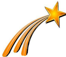
Table Sponsor ($1,750)